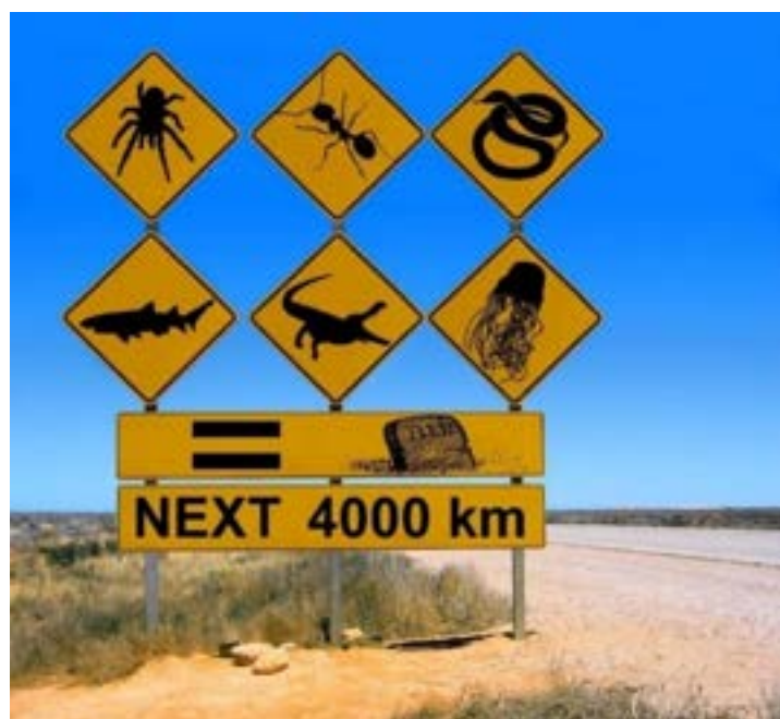
This one is specially for our Aussie guests

27 January 2024 – Orchid Fair – Western Springs Garden Community Hall