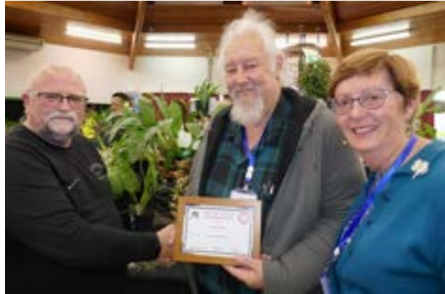
Best Small Display – North Shore Orchid Society