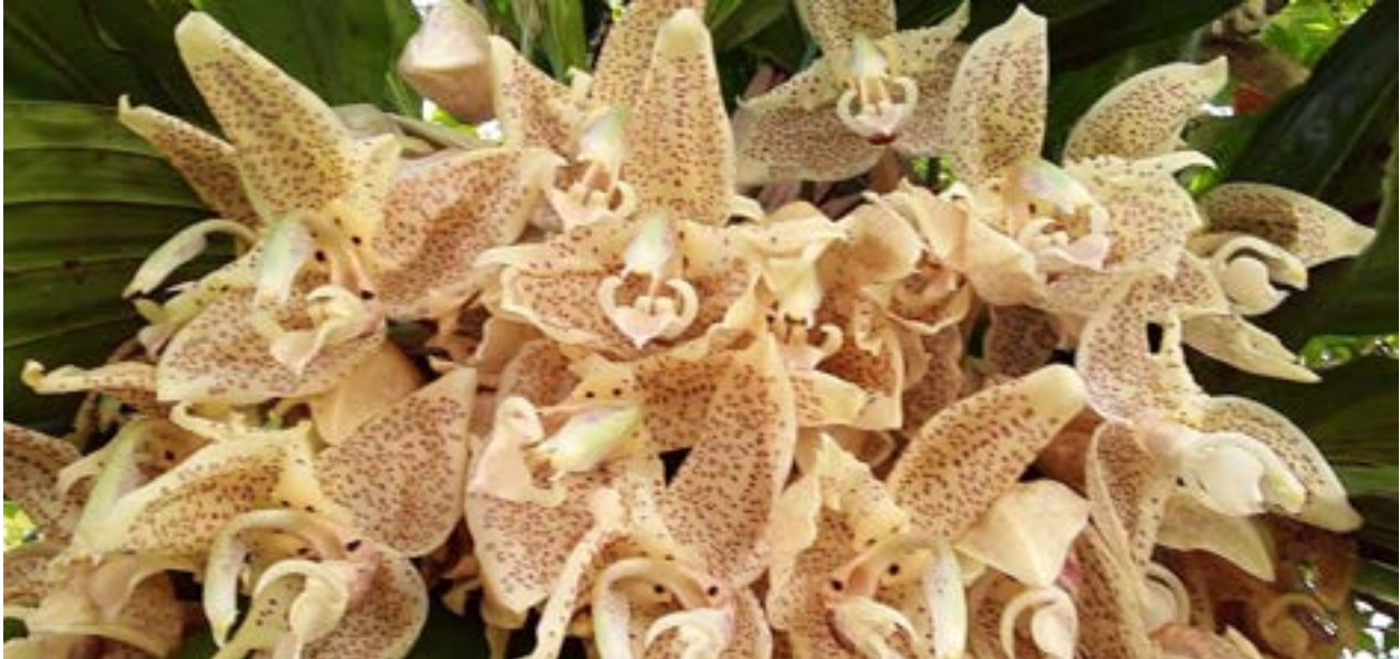
A spectacular flowering of Yvonne's Stan. oculata

They don't last long, they are generally highly scented, they weirdly flower from underneath so can't be grown in a pot, but their strange and unusual shapes get everyone's attention.