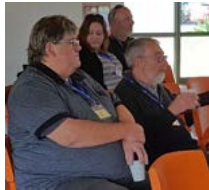
Even the lecturers took in other lectures

It was a lot of work to put the show together, and I would like to thank all those involved that helped to put it together, in what was a memorable two days of emersion in all things orchid. And especially, a big thank you to our three guest speakers, who did such a wonderful job.