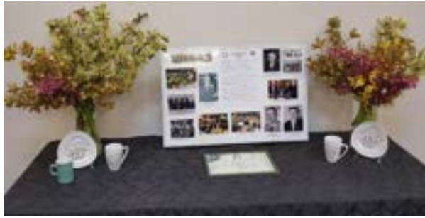
Memorabilia and history on display