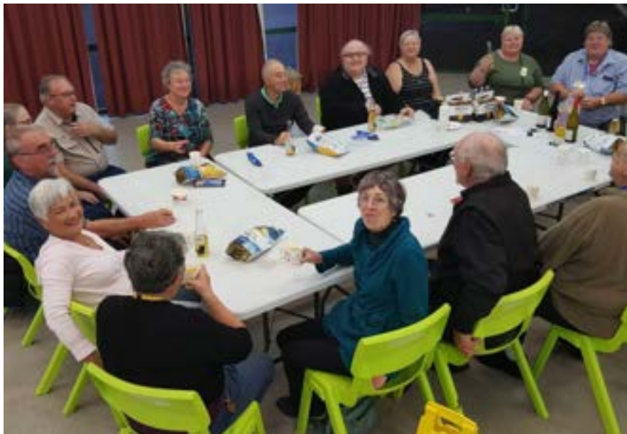
With the show dismantled, the workers and helpers were finally able to relax

It was a lot of work to put the show together, and I would like to thank all those involved that helped to put it together, in what was a memorable two days of emersion in all things orchid. And especially, a big thank you to our three guest speakers, who did such a wonderful job.