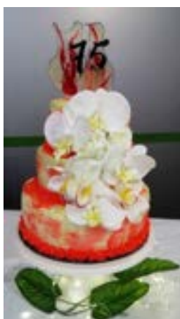
The beautiful 75th cake