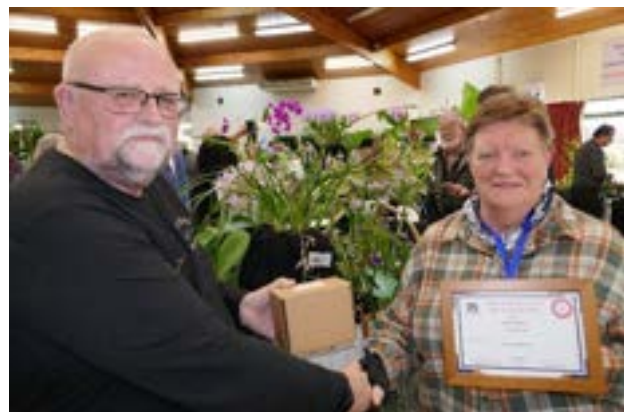
Best Cymbidium – Rosella Orchids