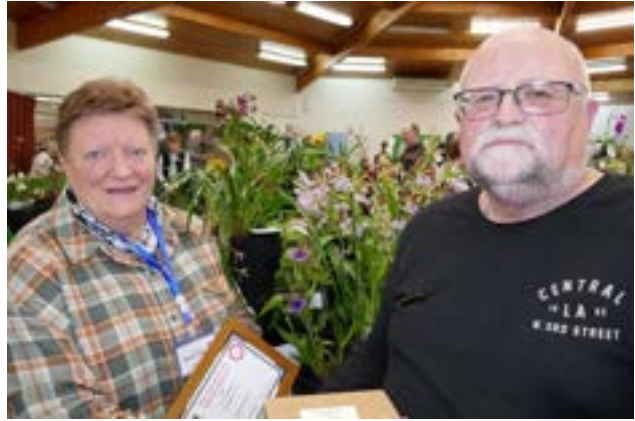
Best Cymbidium – Rosella Orchids