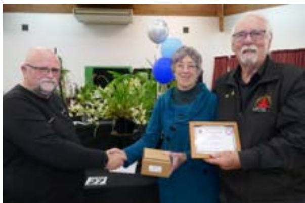
Best Dendrobium – Leroy Orchids