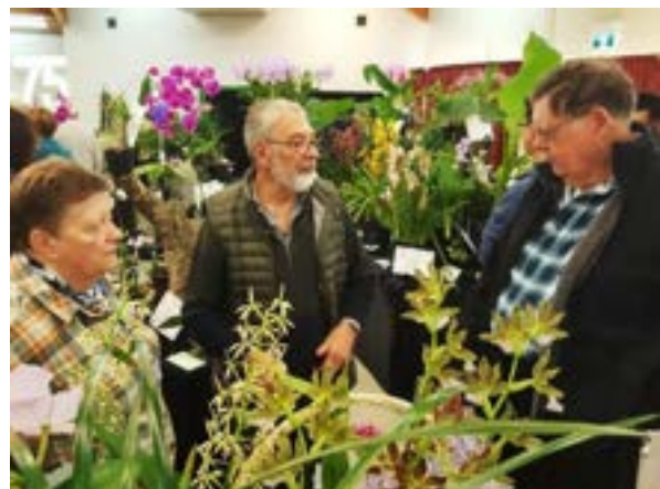
An example of Rareus (Rss.) clive hallsii found amongst the displays