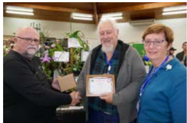
Best Paphiopedilum – P & B Jenner