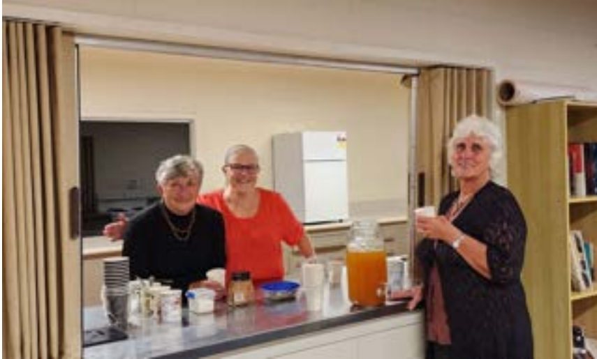
Tea's up – members enjoying a break in proceeding at the meeting