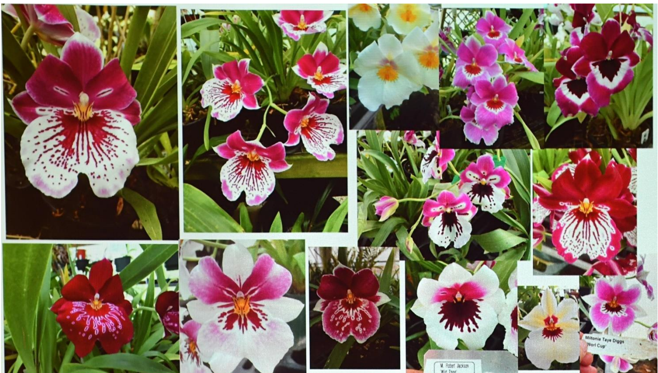
Some of Allan's favourite orchids, the Miltoniopsis, in flower