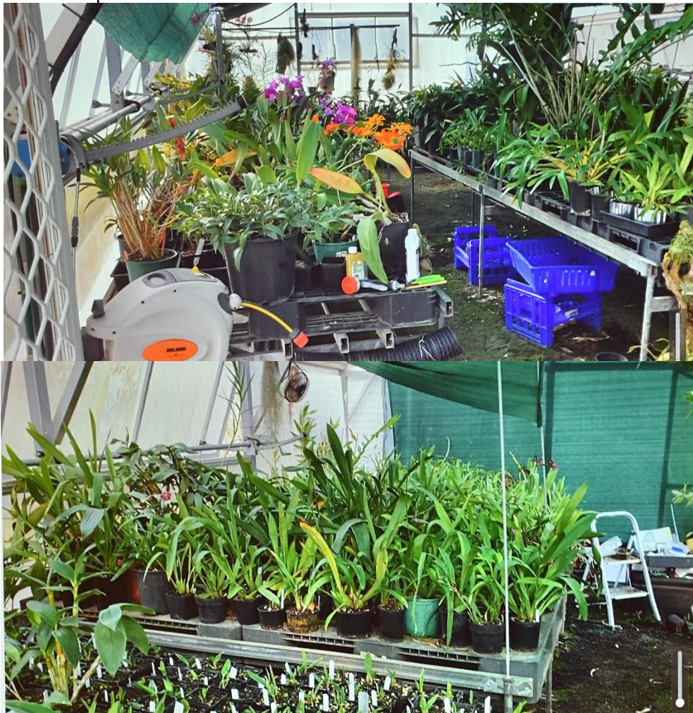
A view of the growing houses for Allan's orchids, which will give you some idea of the diversity of plants he grows