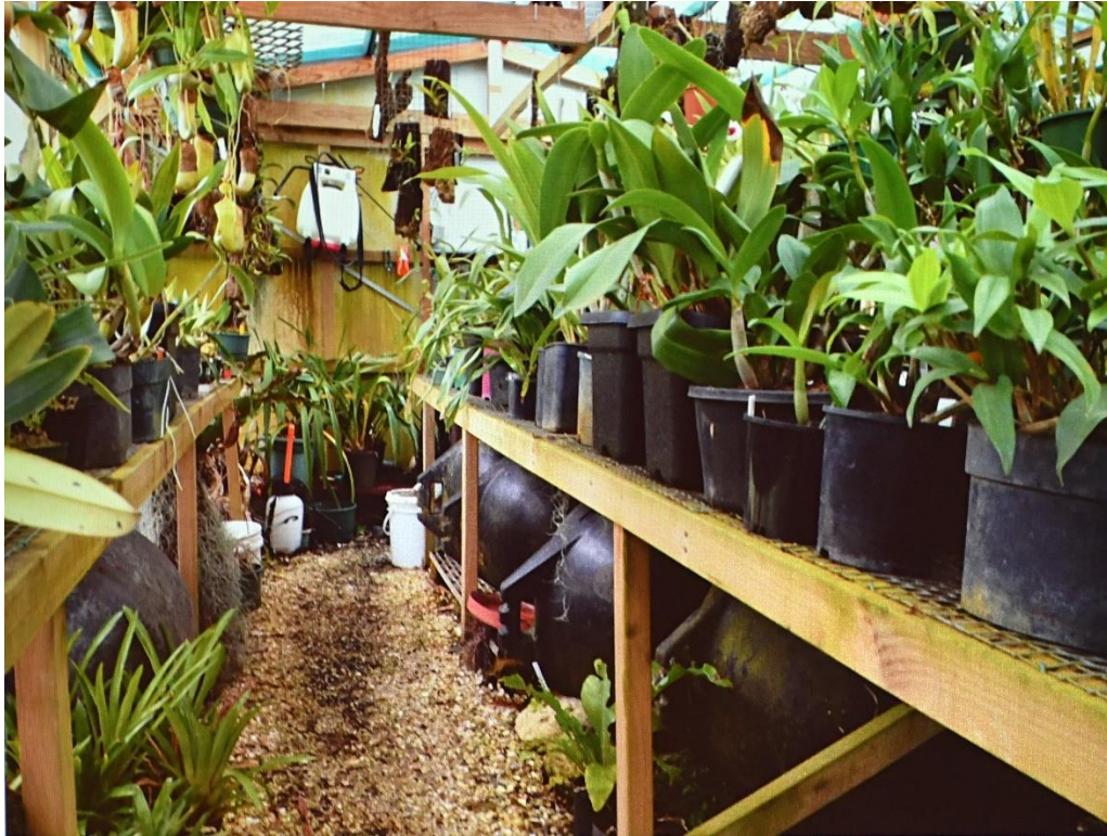
A view of one the houses showing the black mussel floats under the benches (refer more on this below)

One of Allan's experiments involved the use of mussel farm floats. Coming from the Coromandel where there are a number of mussel and oyster farms operating, I guess these are somewhat commonplace there.